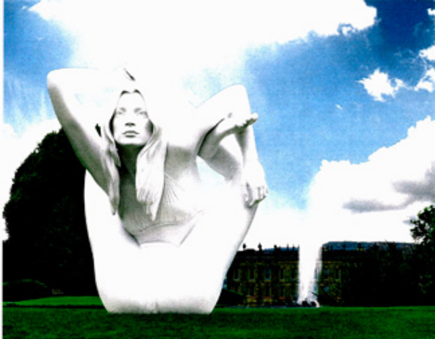
Above: Marc Quinn's sculpture of Kate Moss at Chatsworth was inspired by a visit to Easter Island. Below: use Posada de Mike Rapu as a base to see Moai sculptures, made from compressed volcanic ash.

the island's only populated village, Hanga Roa. Like the two nine-room Explora-owned hotels that preceded it (known as Casas Rapa Nui, opened in 2006), its modern design will appeal to aesthetes, the indoor pool and Jacuzzi to sybarites. However, the point of a stay is more anthropological: guests can enjoy lodge-assisted tours by foot, bike or 4WD to the island's ahus (ceremonial burial platforms) and Moai sculptures made from compressed volcanic ash. A recommended two-centre expedition, using Santiago as your hub, should include a visit to CHILE 's high-altitude Atacama Desert where a new high-end hotel and spa, Tierra Atacama >>