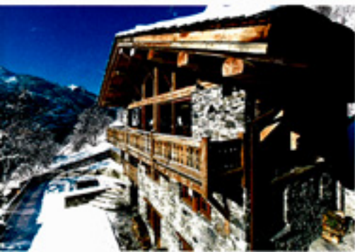
Above: the 12-person Chalet Merio in the French Alpine resort of Le Miroir. Below: Coliba National Park in Panama, a Unesco World Heritage Site since 2005.